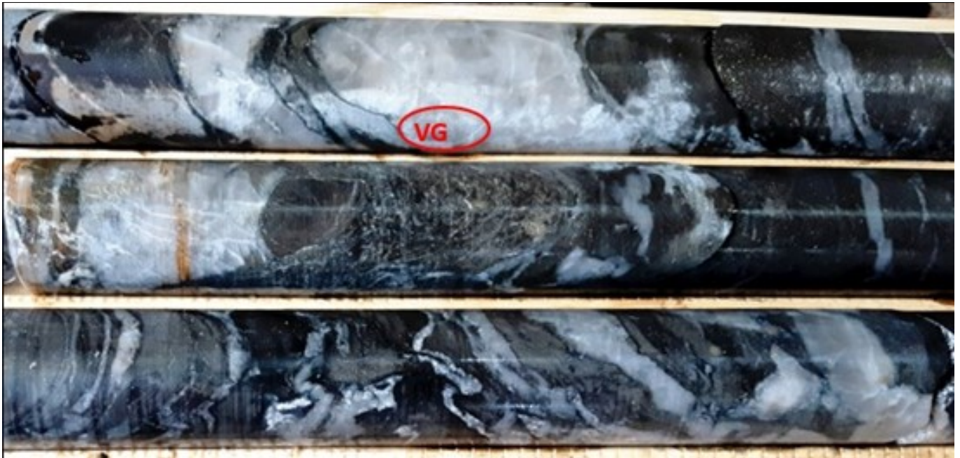
Figure 2 – F-Zone Mineralization in Hole TB21-005A at Around 1099 m. Sample #445087 Within Photo Returned 50.6 gpt Au Over 1.0 m From 1095.0 To 1096.0 m.

To view an enhanced version of this graphic, please visit: https://orders.newsfilecorp.com/files/7659/87889_tombill2_550.jpg