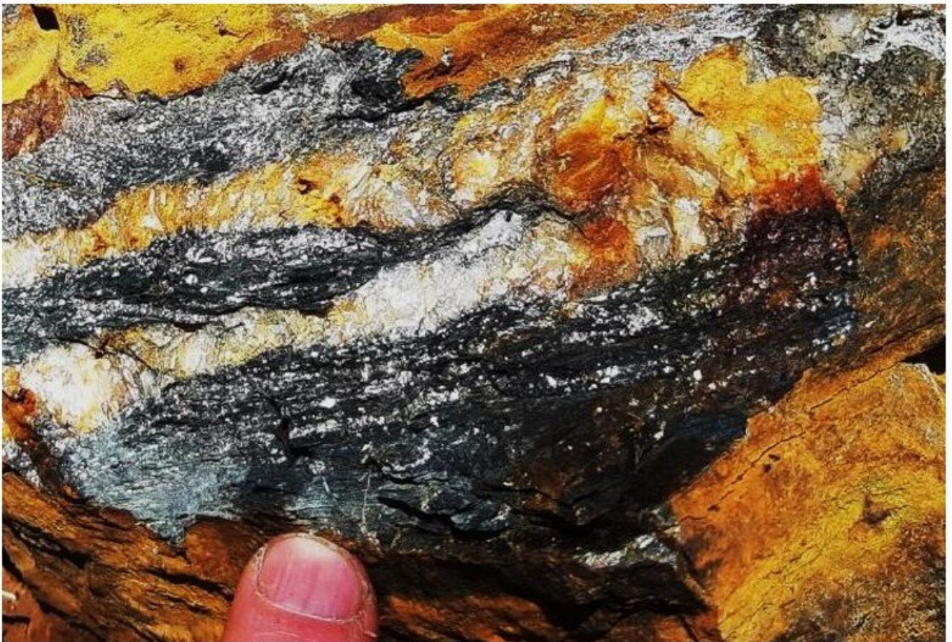
Figure 3 – Mineralised Iron Formation

Mineralization is adjacent to a quartz-feldspar porphyry (QFP) dyke that is sericite-altered. The QFP is the same dyke that extends from the proposed open pit at the Hardrock Mine and is also the same QFP associated with F-Zone type mineralization at depth as outlined by Tombill's deep exploration program.