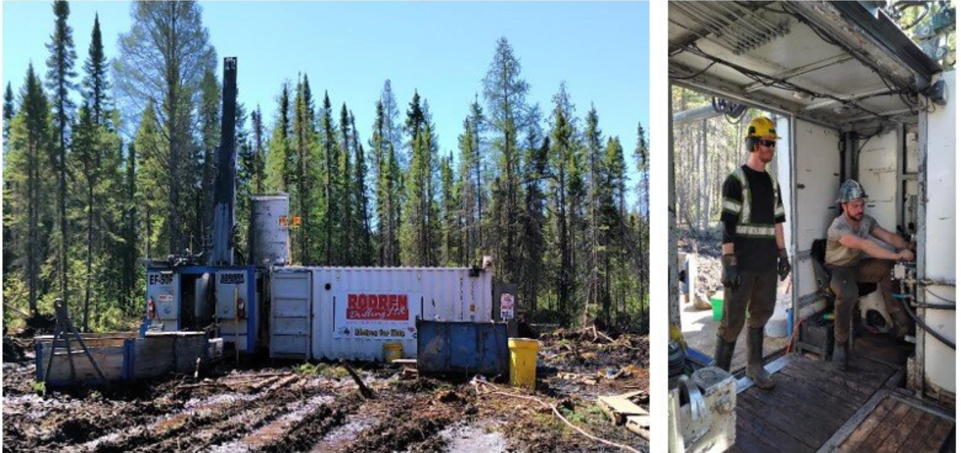
Figure 5 – Rodren Drilling

https://images.squarespace-cdn.com/content/v1/5fbd12ede1faa43f8c8733d7/1622724083201-NHP5B11OJN9I85772DRN/tombill-mines-rodren-drilling.jpg data-image-dimensions="780x430" data-image-focal-point="0.5,0.5" data-load="false" data-image-id="60b8cdf201bf8610e57731dc" data-type="image" data-image-resolution="1000w" />