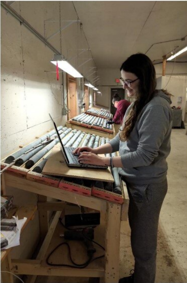
Figure 4 – Core Shack