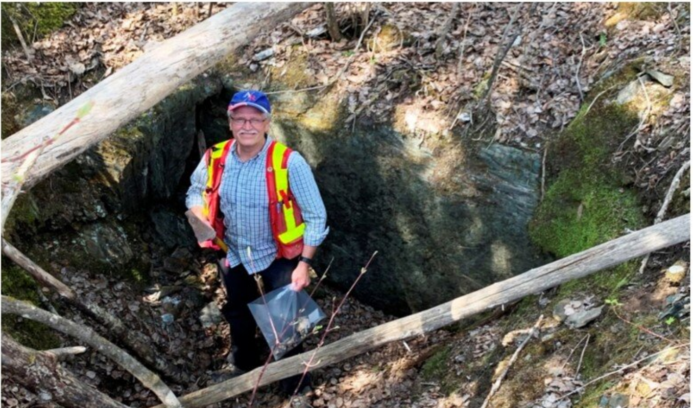
Figure 2 – Historic Sampling

First sampling of historic trench in East Porphyry Zone, in May 2021.