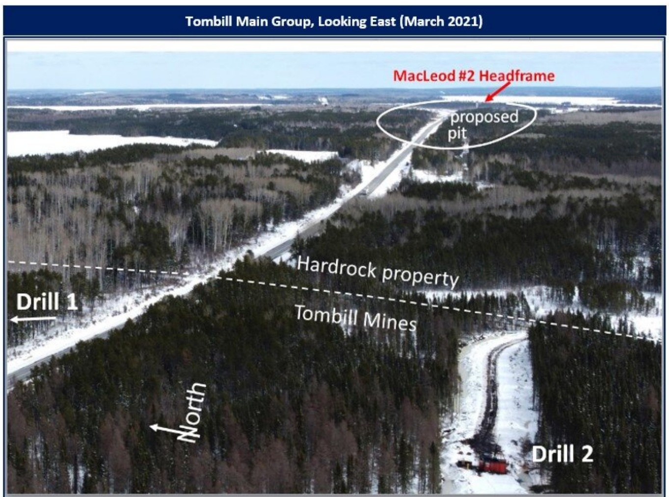
Figure 1: Aerial photo of drill at Tombill, looking east, March 2021