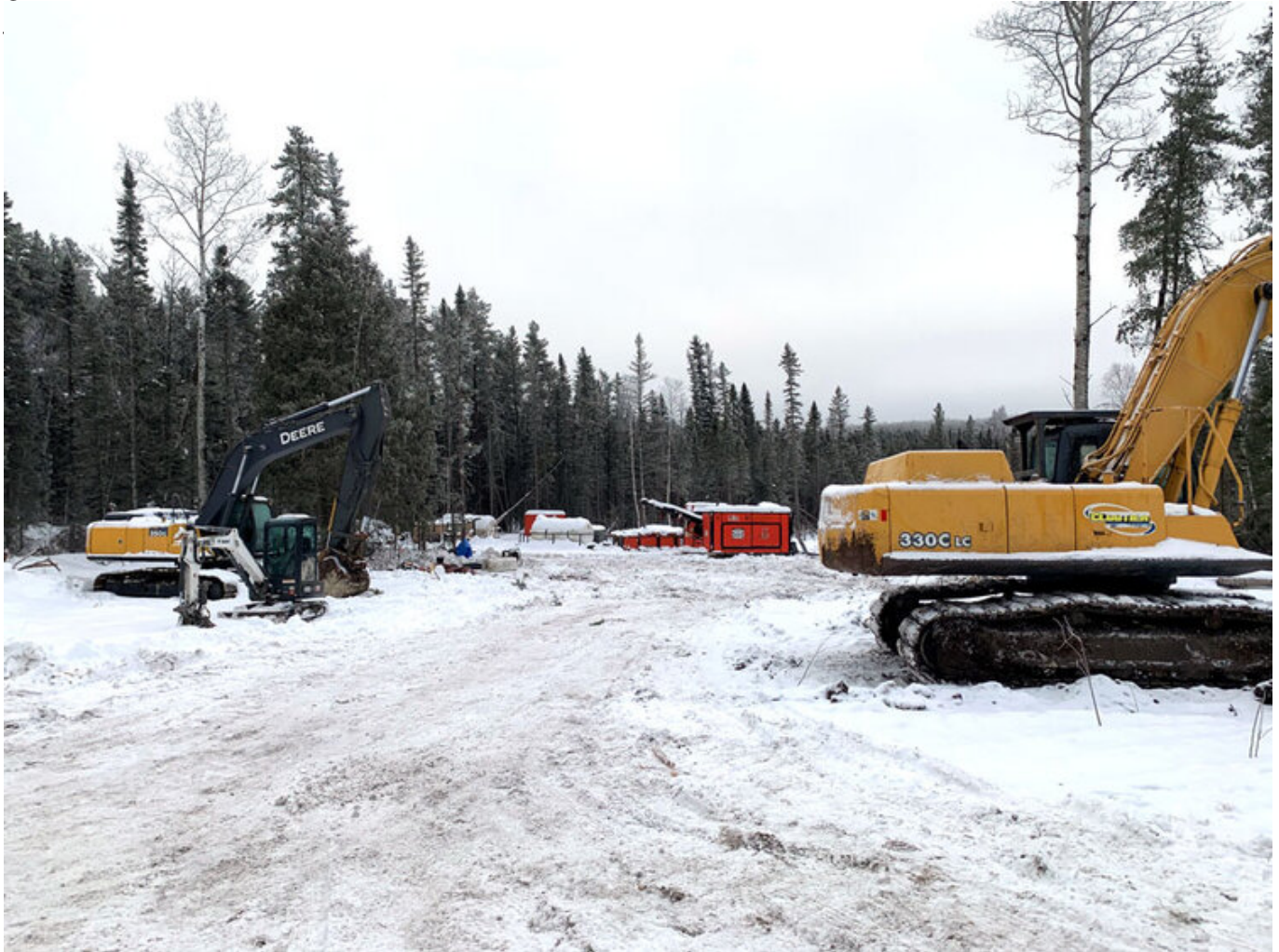
Drill at 1st Hole