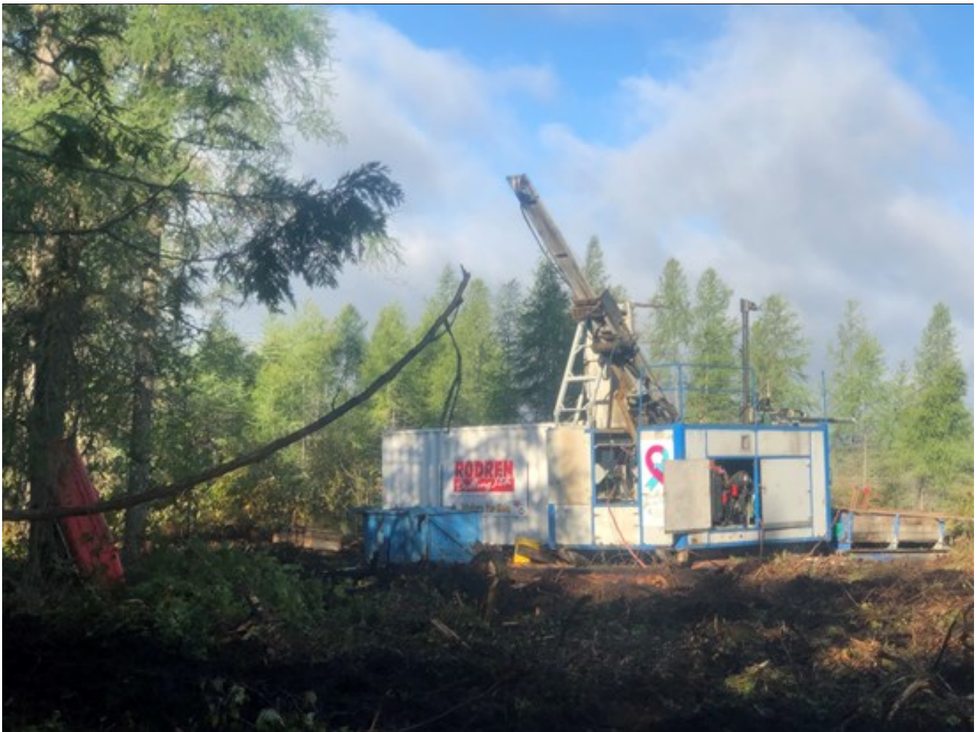
Figure 2 – Shallow Drilling at Talmora

In tandem with Tombill's deep F-Zone drill campaign, the Company is also undertaking aggressive surface exploration. A near-surface drill program started some two weeks ago on Tombill Main Group's Talmora target located in the northeast corner of the property in areas surrounding a past producing Talmora gold mine. To date, two holes have been completed in the 300 to 450 metre range, and a third hole is currently in progress. The target is a broad zone believed to have potential for disseminated mineralization.