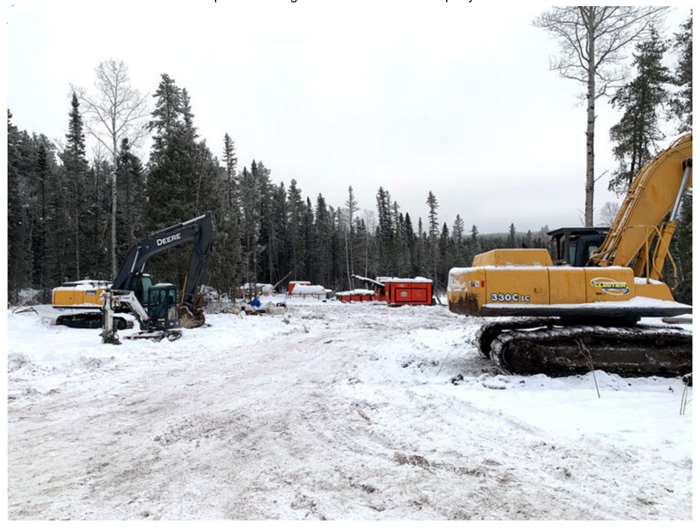
Drill at 1st Hole

Tombill Mines Limited Kicks Off Exploration Program At Our Patented Property Within Ontario's Geraldton Gold