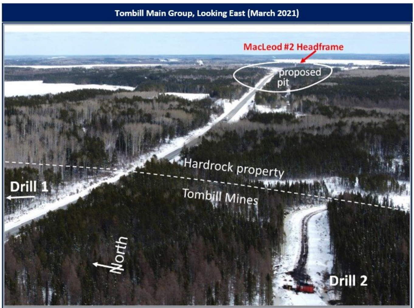
Figure 1: Aerial photo of drill at Tombill, looking east, March 2021